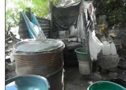
Without a pila, water is stored in whatever containers can be found

This year's One Day Challenge, in partnership with the Association for a More Just Society, will focus on providing pilas, latrines, galeras (outdoor kitchens) and concrete floors, and ditches to provide protection against flooding.