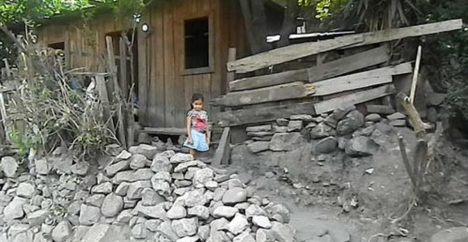
A house in La Cantera

Change is coming slowly to Honduras. But in many communities the average income remains as little as a dollar a day. No matter how hard these people work, just surviving can seem like an endless struggle.