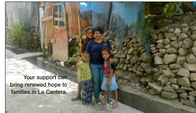
Your support can bring renewed hope to families in La Cantera.