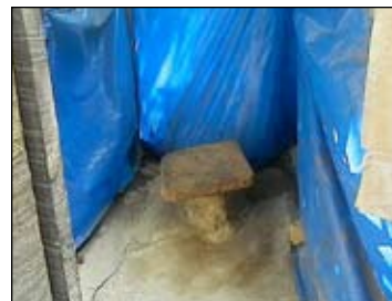
Many latrines are old and have exceeded their capacity