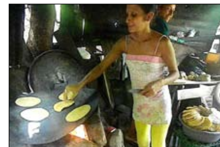
Making tortillas to sell