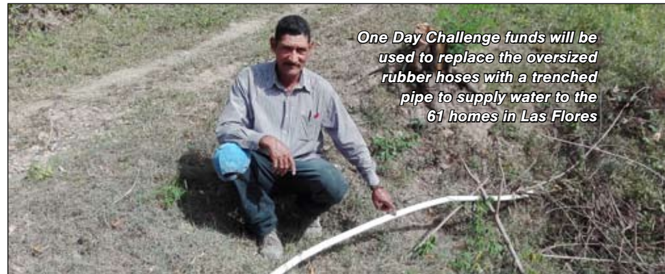
One Day Challenge funds will be used to replace the oversized rubber hoses with a trenched pipe to supply water to the 61 homes in Las Flores