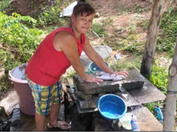
Las Flores receives its water from an intermittent spring-fed stream where water is captured (right) in a 27 year-old basin. One Day Challenge funds will be used to construct a storage tank and 700m of trenched pipe to bring a more reliable supply of water to the community.