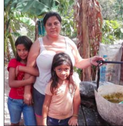
Your support will improve the obsolete water system, in order to provide a reliable supply of water in Las Flores.

Repairing their communal water system and constructing proper latrines is beyond the financial capability of families that earn just $2.00 per day. But YOU can help the people of Las Flores to realize their dream of a better future for themselves and their children through your support of the One Day Challenge.