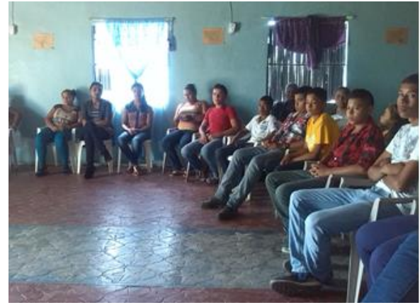
Meeting with students in the community of El Guanabano, Olancho.