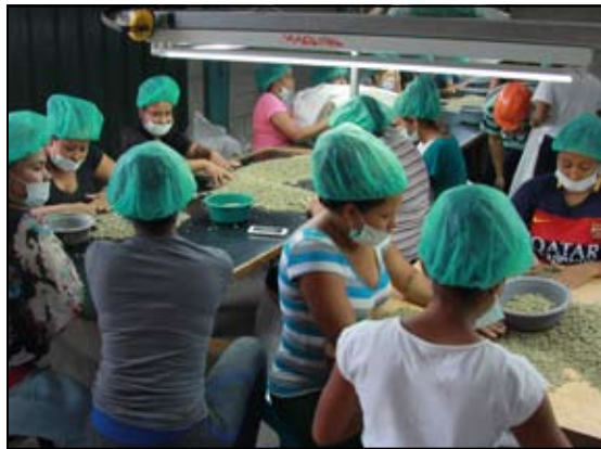
Highly trained workers at COCAOL conduct a triple hand-sorting to remove any defective beans and ensure premium quality