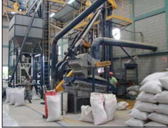
Rio Olancho Direct Trade Coffee is processed and prepared for export at the modern COCAOL facility in Santa Maria del Real