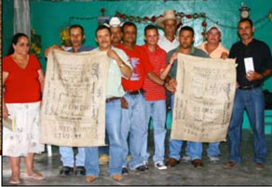
The founding group of producers from El Carrizal